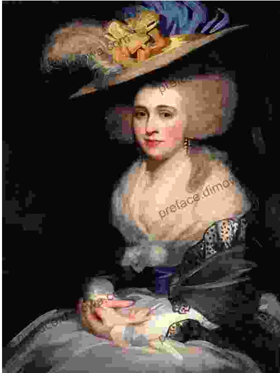
Abigail 'Nabby' Smith, a portrait showcasing her determination and compassion

Abigail 'Nabby' Smith, the eldest daughter of Abigail Adams, inherited her mother's intellect and passion for social justice. Despite facing constraints as a woman of her time, she dedicated her life to serving others. As a schoolteacher, she played a vital role in educating young women and preparing them for active citizenship.