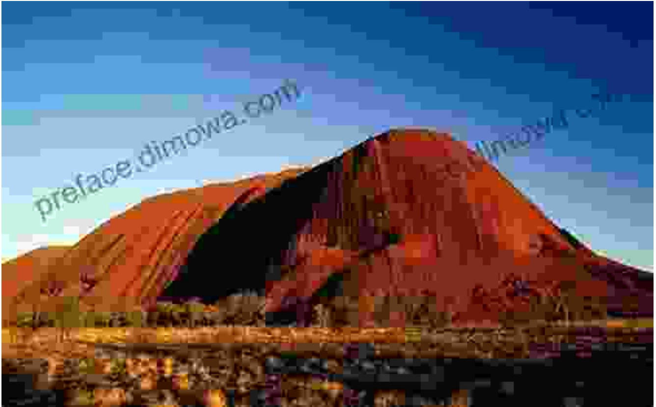
Uluru (Ayers Rock)