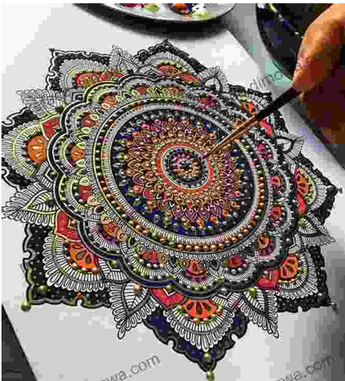
The Art of Relaxation and Mindfulness

The meticulously crafted patterns offer both challenge and a sense of accomplishment. As you meticulously fill in each section, you will feel a surge of satisfaction and a growing connection to your artistic side. "Color My World" is not only a coloring book but a canvas for your creativity, where you can experiment with different colors, patterns, and techniques.