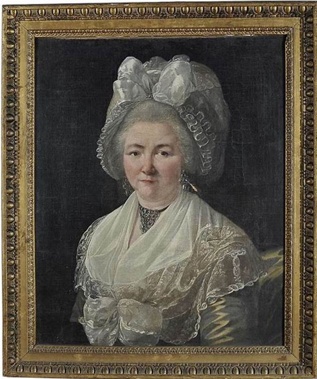
José Malhoa, 'Retrato de Senhora,' 1895. Oil on canvas, Museu Nacional de Soares dos Reis, Porto